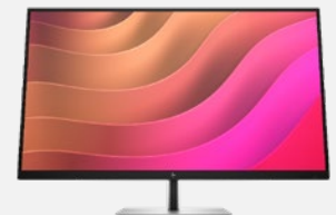
HP E32k G5 Monitor